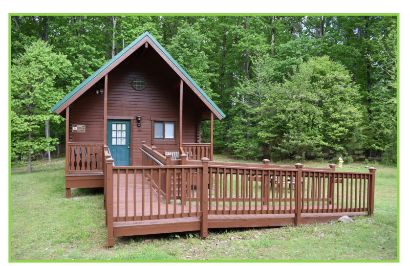
HILL TOP CABIN 281: "Short walk to the Lake" Handicap Accessible 1 Bedroom, 1 Bathroom Max Occupancy: 4 (1 Full, Open Loft)